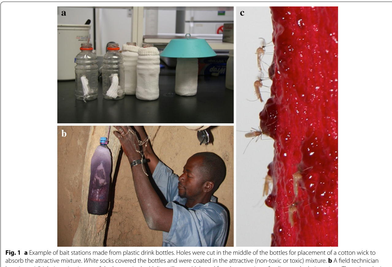
hanging a 1.5-L bait station in one of the houses in the Malian village. C Male and female mosquitoes feeding on the bait stations. The colour dye is ingested and stains the abdomen of the mosquitoes allowing for easy detection of mosquito feeding.